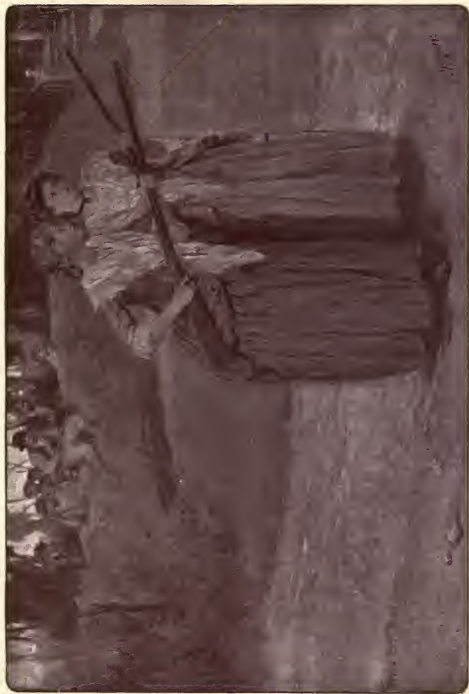
The Defenders of the Fortress.